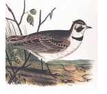
Sky lark Ln.